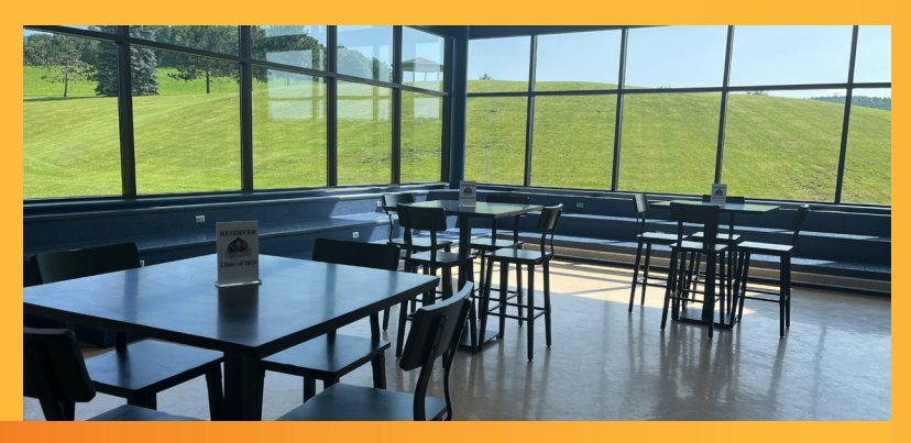
SENIOR LUNCH AREA

Dismissal for PK-6 students will be approximately 2:40 PM and the bell for grades 7-12 will be at 2:45 PM. Our goal is for the buses to pull out of the parking lot at 2:50 PM.